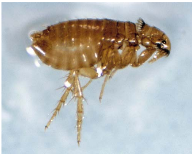
Figure 3. Cat flea adult.

(double their unfed size). Under magnification they can be seen to have both genal and pronotal combs (ctenidia), differentiating them from most other fleas of domestic animals.