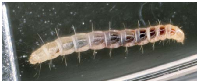
Figure 2. Cat flea larva.